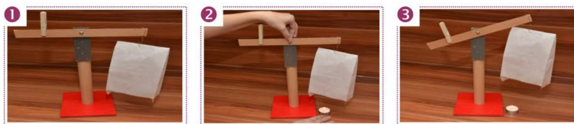
Fig. 3 Experiment 3 "candle beneath paper bag" (German captions omitted)

Experiment 4: This is preferably only for older children (12 years up). A small paper bag (open underside) is balanced on a self-constructed balance with the help of a clothes-peg (Fig. 3).