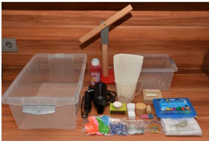
Fig. 1 The contents of the research box “buoyancy”

The research box comprises instructions and material for four experiments (Fig. 1), which can easily be done by pupils with the exception of Experiment 4 where a candle is used and which thereby has to be done under supervision of a teacher.