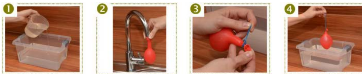
Fig. 2 Experiment 2 "balloon filled with water in water" (German captions omitted)

Experiment 2: An ordinary balloon is filled with not too much water, knotted, and attached to a not too short rubber band (Fig. 2). Then the balloon is immersed into the water pot (presumably the same as before). The reduction of the balloon's weight and the rubber band's length shall be noticed and buoyancy consciously felt by the pupils.